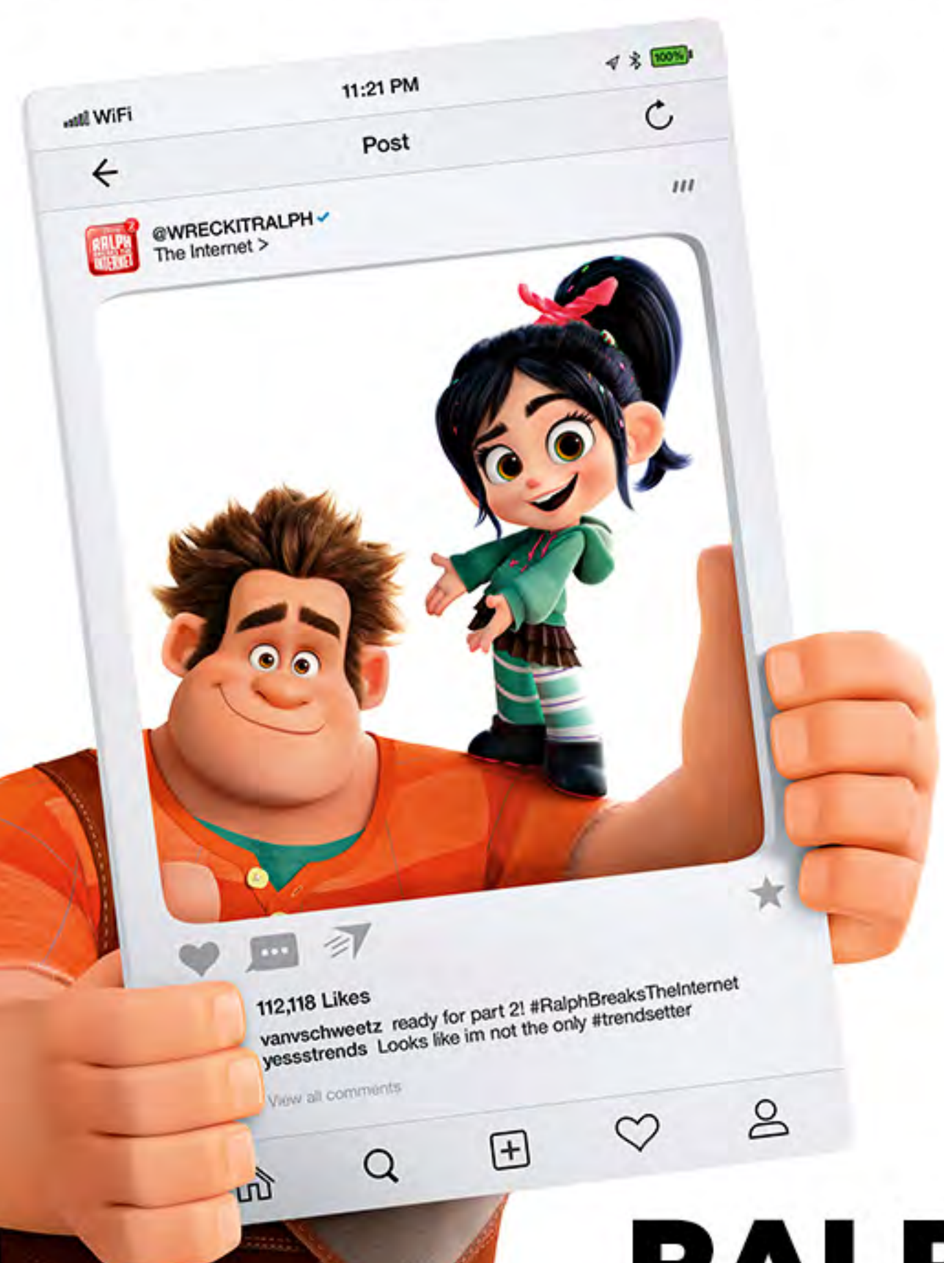
RALPH & VANELLOPE