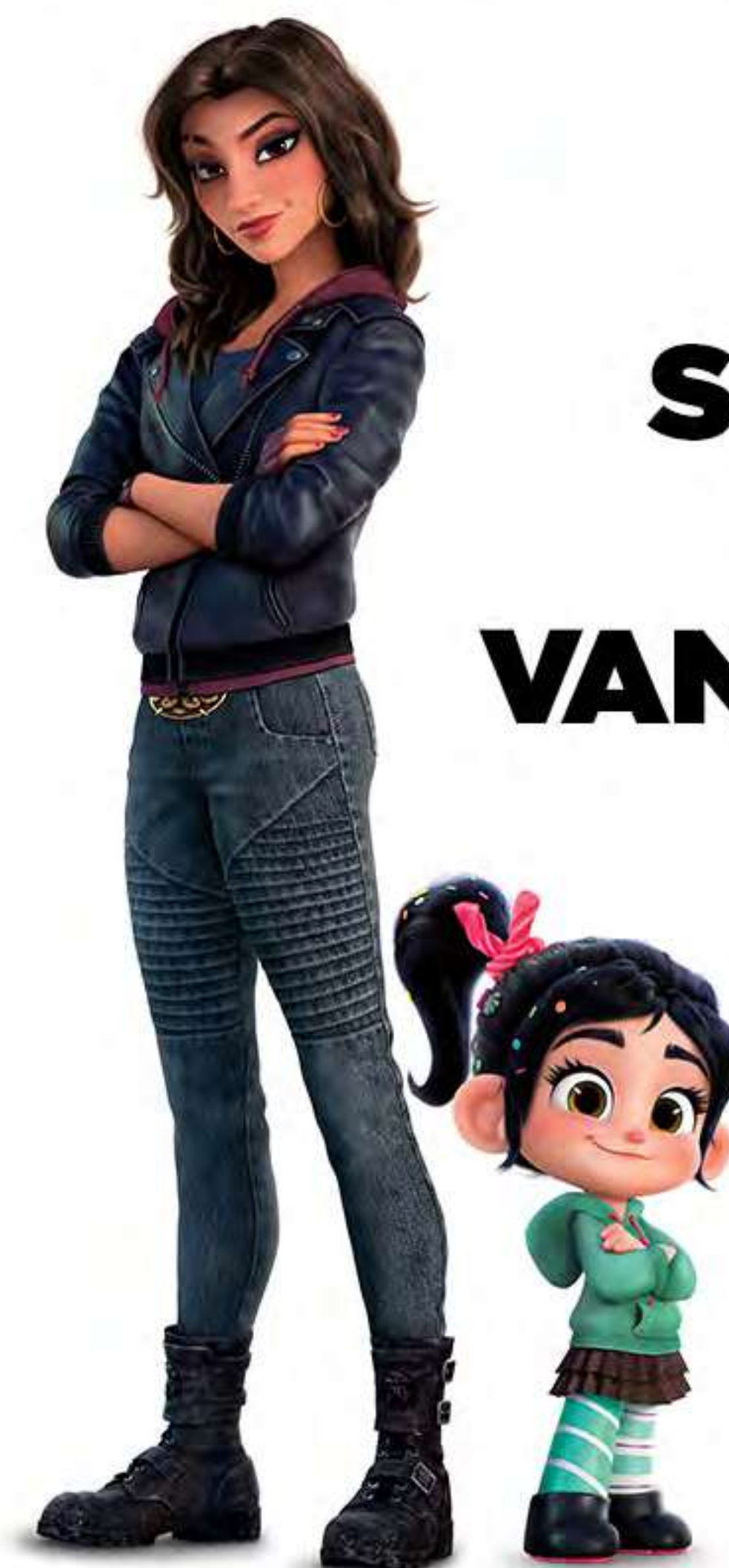
SHANK & VANELLOPE