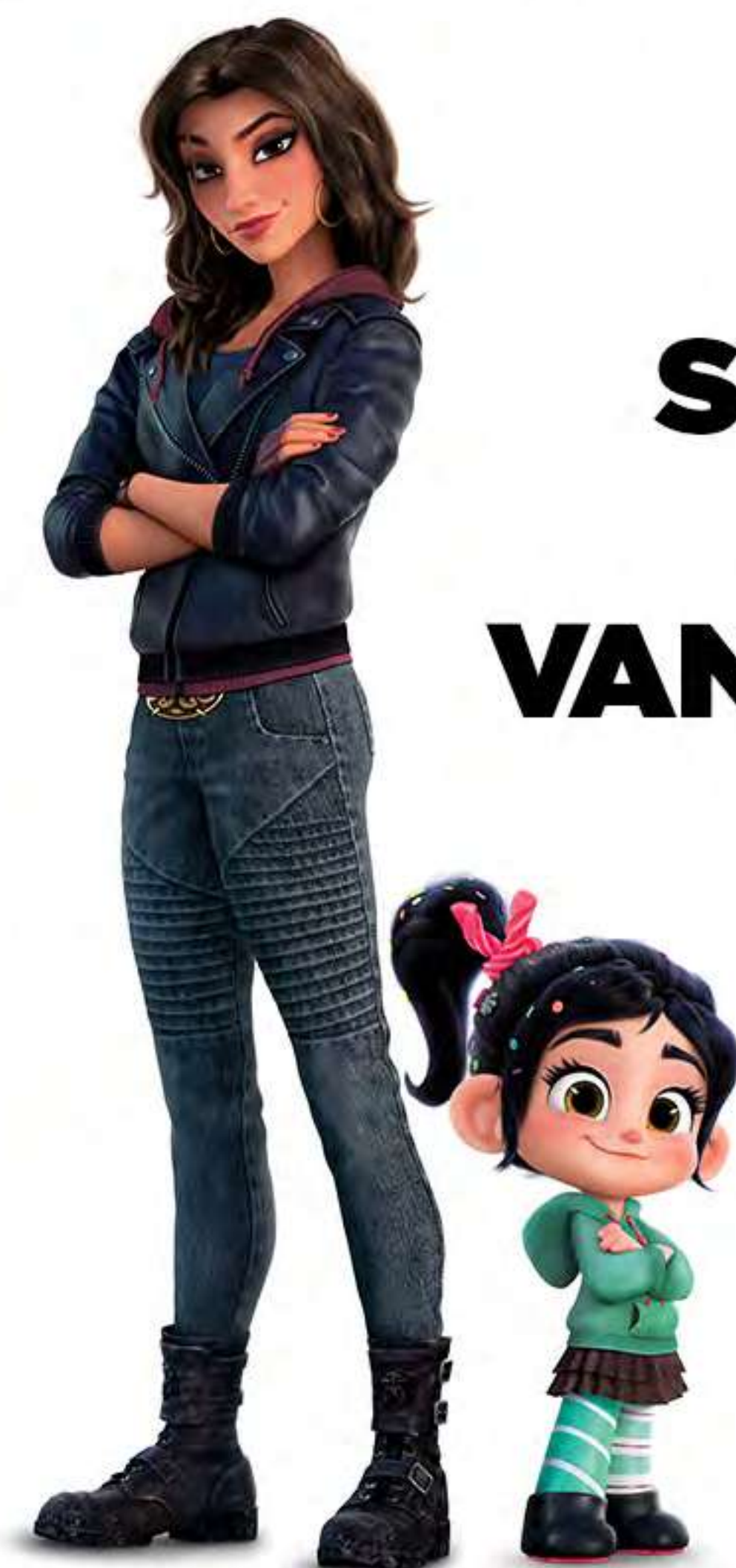
SHANK & VANELLOPE