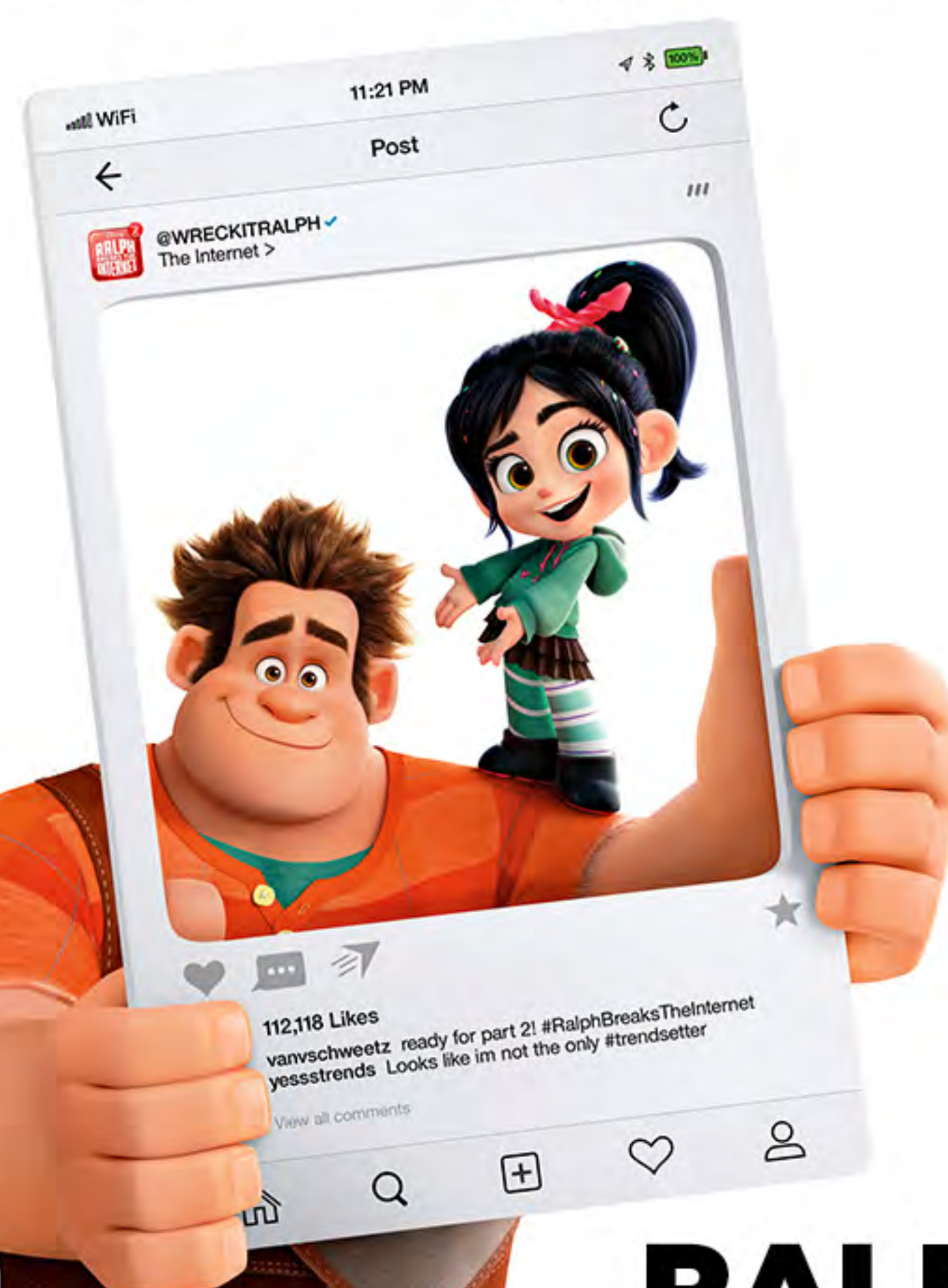
RALPH & VANELLOPE